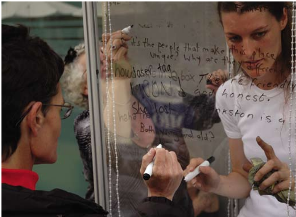
The Surveillance with Public Intent Vehicle, Frankston, 2007