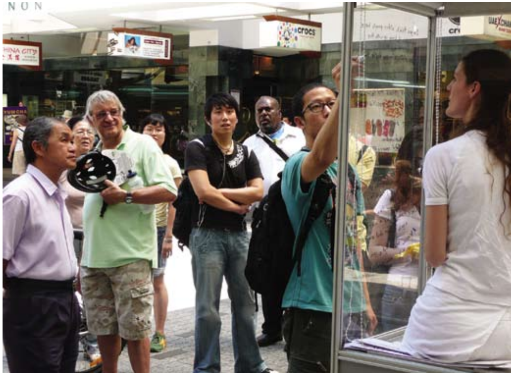
The Surveillance with Public Intent Vehicle, Brisbane, 2007 © Louise Doble